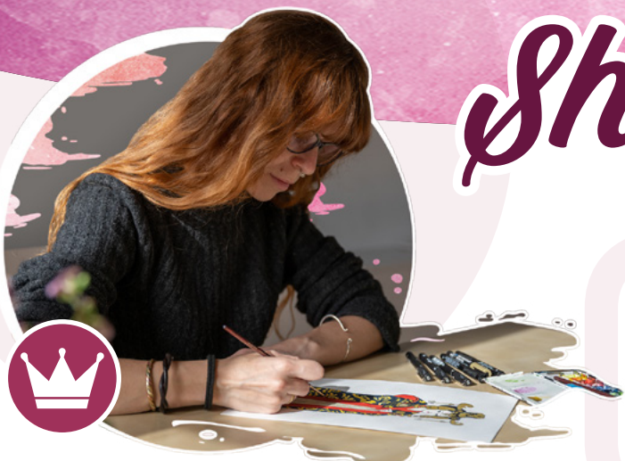
Illustration & Community Manager